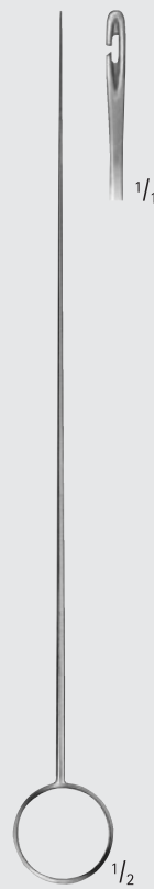
FB653R Guide only Mandrin allein